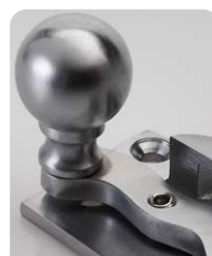
Satin Chrome Plated