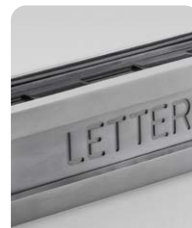
Satin Chrome Plated