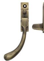
Antique Brass (AB)