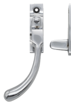
Chrome Plated (CP)