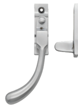
Satin Chrome Plated (SCP)