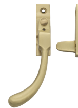
Satin Brass (SB)