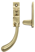
Polished Brass (PB)