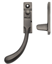
Tudor Bronze (TB)

Distinctive finishes are the hallmark of Hardwick Classic ironmongery - for more detail and maintenance information visit: www.hardwick.co.uk/pages/finishes