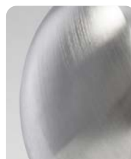
Satin Chrome Plated